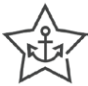
Opposite Aldi & Pet Barn